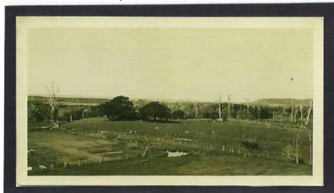
Baywood Chase before the roads and houses