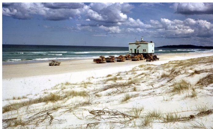
Sandmining at Tallow Beach