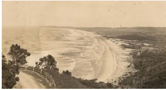
Tallow Beach from the lighthouse

And, going back in time a bit further, see the article in the Courier Mail from 1941, announcing a gold find near Byron Bay. You can find the article on > http://trove.nla.gov.au/ndp/del/printArticleJpg/44897841/3?print=n